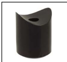
Stacking Buffers with continuous 5 mm drill hole, for screwing on