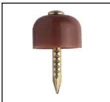
Shelf Supports with movable pin

Material: polystyrene Colour: white or brown