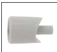
Stacking Buffers with peg to put on