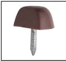
Shelf Supports with fixed pin

Material: polystyrene Colour: white or brown